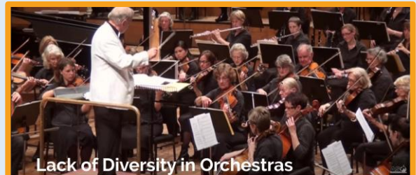
Lack of Diversity in Orchestras

Address the underrepresentation of certain communities of color in American orchestras.